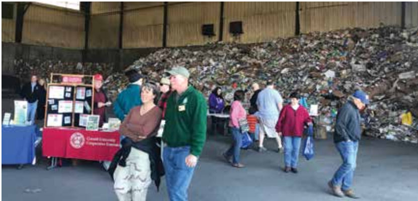
Over 200 attendees visited the Annual Oneida-Herkimer Solid Waste Authority Earth Day Event on Saturday, April 21 from 10 a.m. to 2 p.m., at the Oneida-Herkimer Recycling Center, 80 Leland Avenue Ext. in Utica.

In recognition of the 48th annual Earth Day celebration on April 22, the Oneida County Sewer District's (OCSD) Operation Ripple Effect™ was represented at a number of community events. Earth Day is dedicated to showing support for environmental protection, including opportunities for reuse and making "green" choices to help keep the environment healthy.